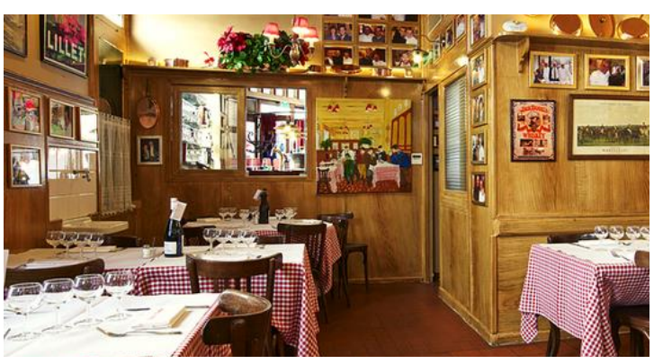
156 RUE DE CRÉQUI, LYON

A unique and convivial Lyonnais bouchon run by two Meilleurs Ouvriers de France.