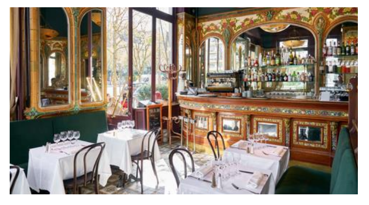
1 PLACE JULES FERRY, LYON

Creative, traditional French cuisine in a unique, heritagelisted setting.