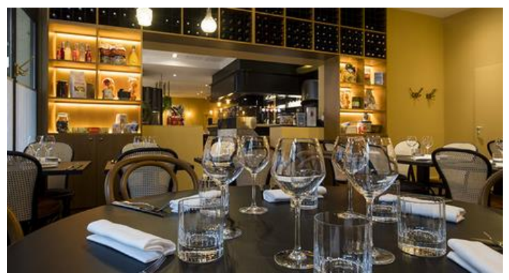
67 BIS COUR VITTON, LYON

Delicious Italian dishes: pasta, pizzas, risottos... cooked in the Italian tradition.