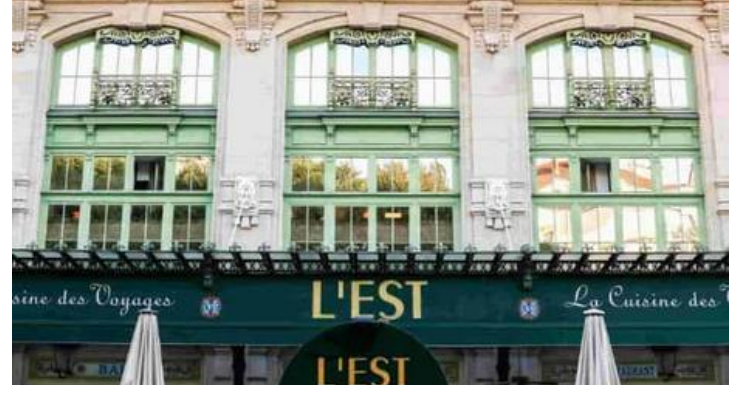
14 PLACE JULES FERRY, LYON

Immerse yourself in the heart of this former train station and taste Bocuse's cuisine!